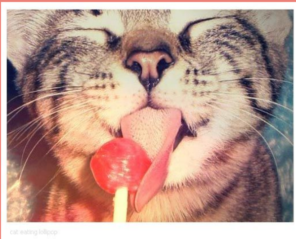
cat eating lollipop